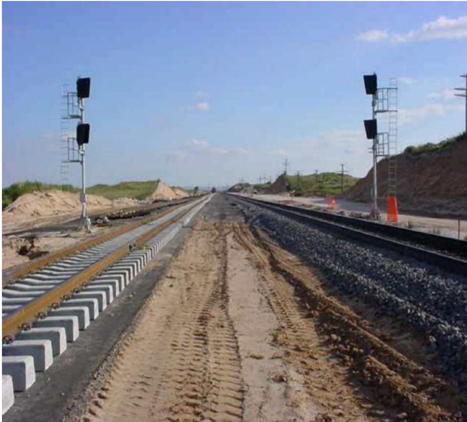
Crossover Construction – Clear Creek, Texas